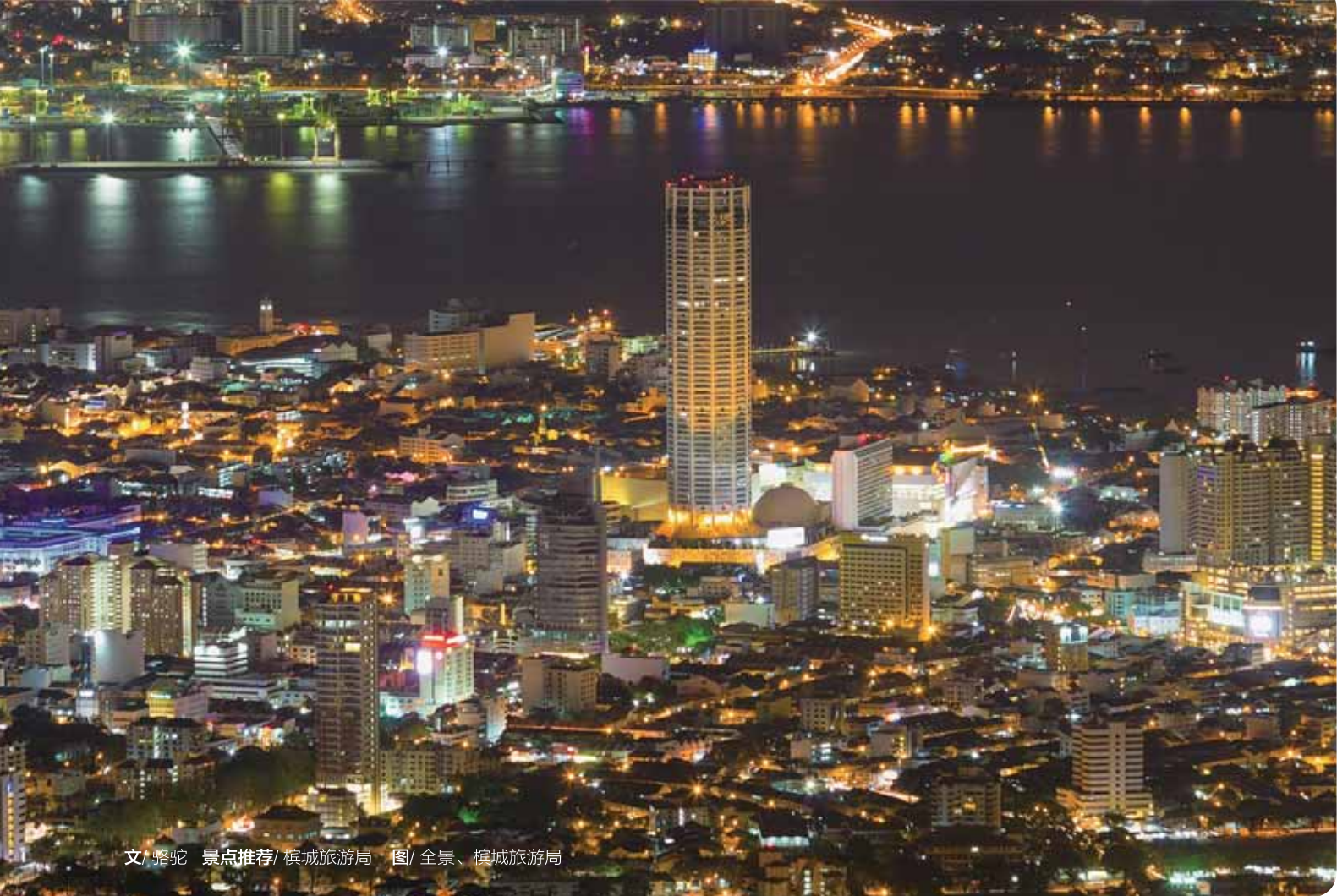
文/骆驼 景点推荐/ 檳城旅游局