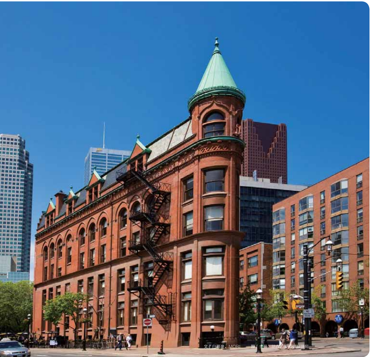
文 / 白慕豪、MORI

次成为全球旅行的焦点。一个世界级宜居城市，不应该只是建筑和空间的集合，更重要的，居住在这里的人无时无刻不在感受她的包容。不同的语言、不同的风俗习惯，带给多伦多极致的“枫”彩。