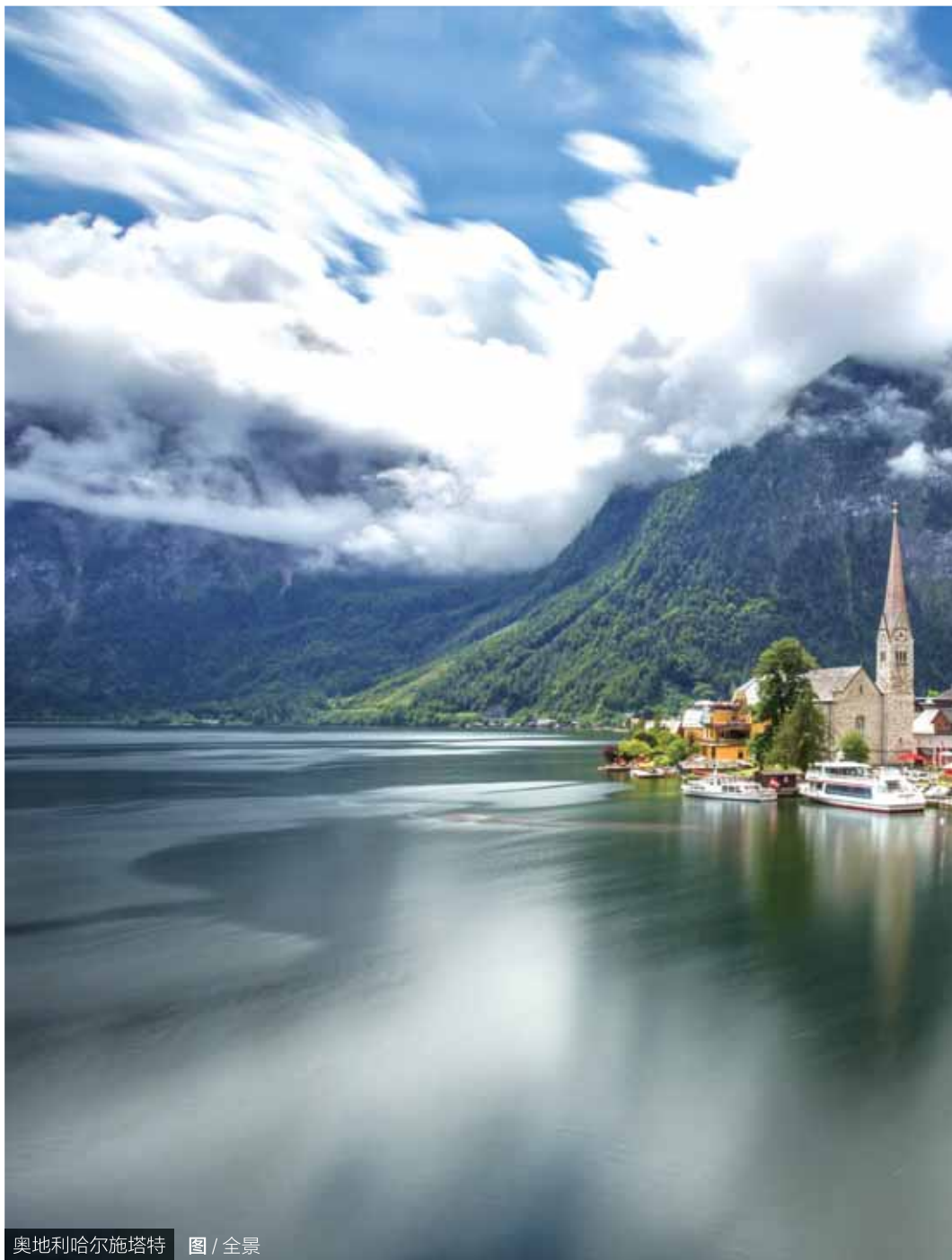
奥地利哈尔施塔特 图 / 全景