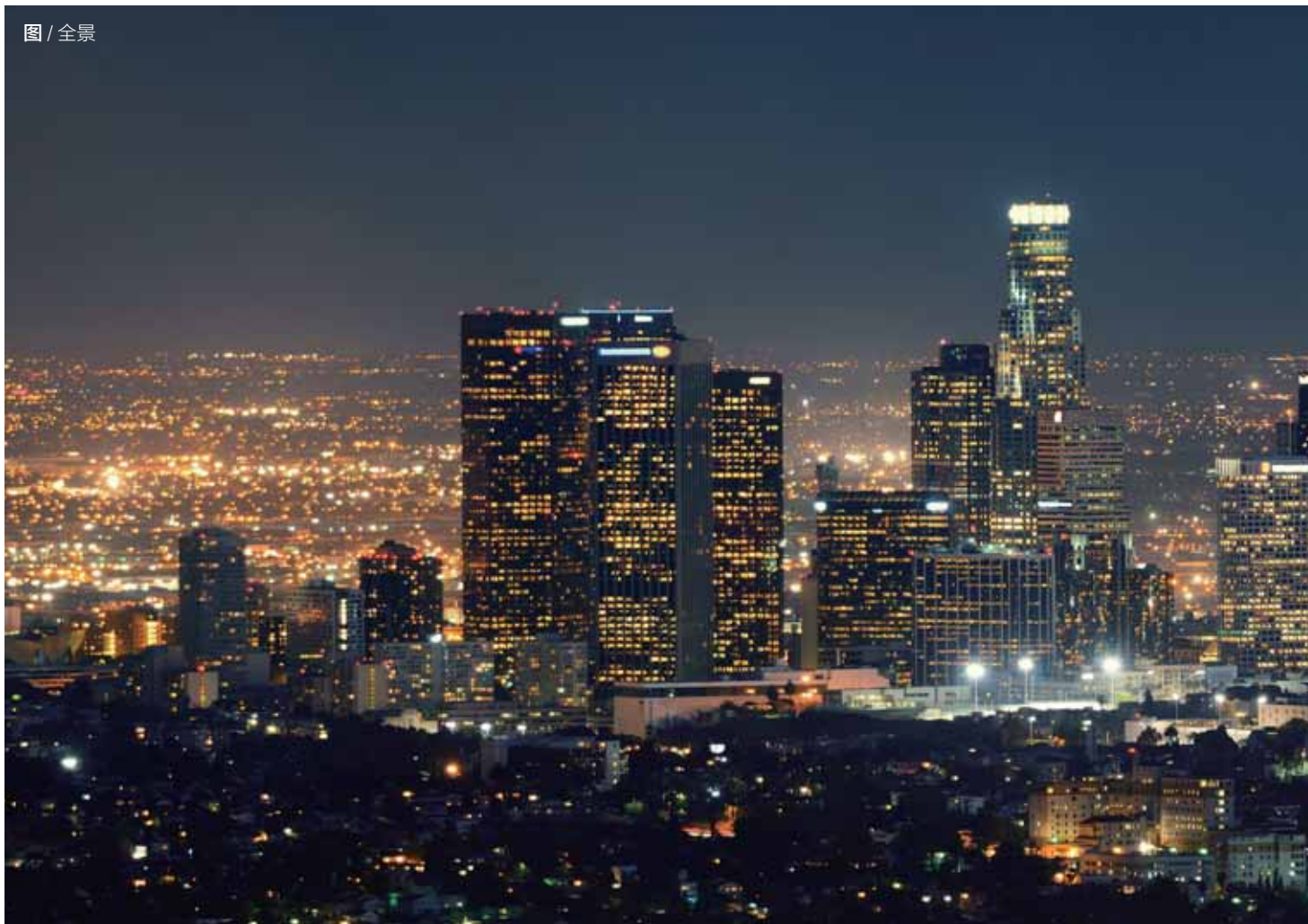
图 / 全景

中国国旅总社，美国西海岸大城小镇 + 七大国家公园 + 四大地貌奇景 12天深度品质游