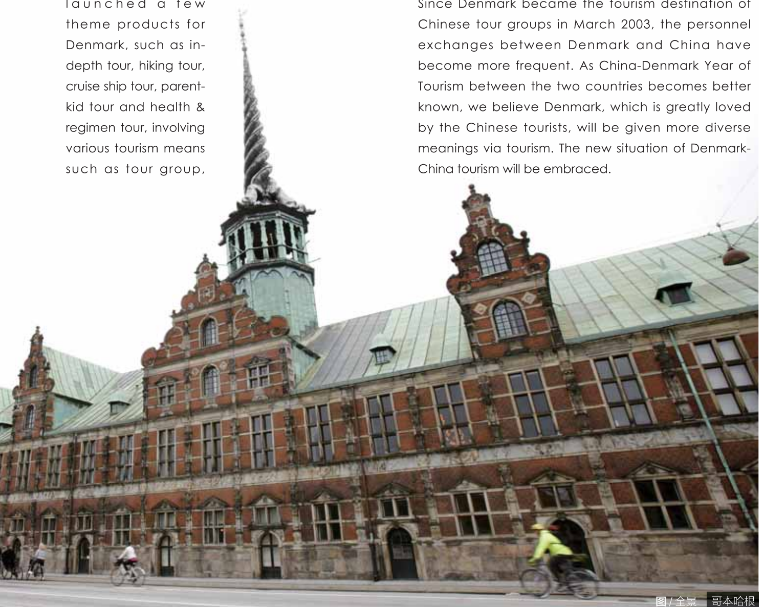
哥本哈根

Since Denmark became the tourism destination of Chinese tour groups in March 2003, the personnel exchanges between Denmark and China have become more frequent. As China-Denmark Year of Tourism between the two countries becomes better known, we believe Denmark, which is greatly loved by the Chinese tourists, will be given more diverse meanings via tourism. The new situation of Denmark-China tourism will be embraced.