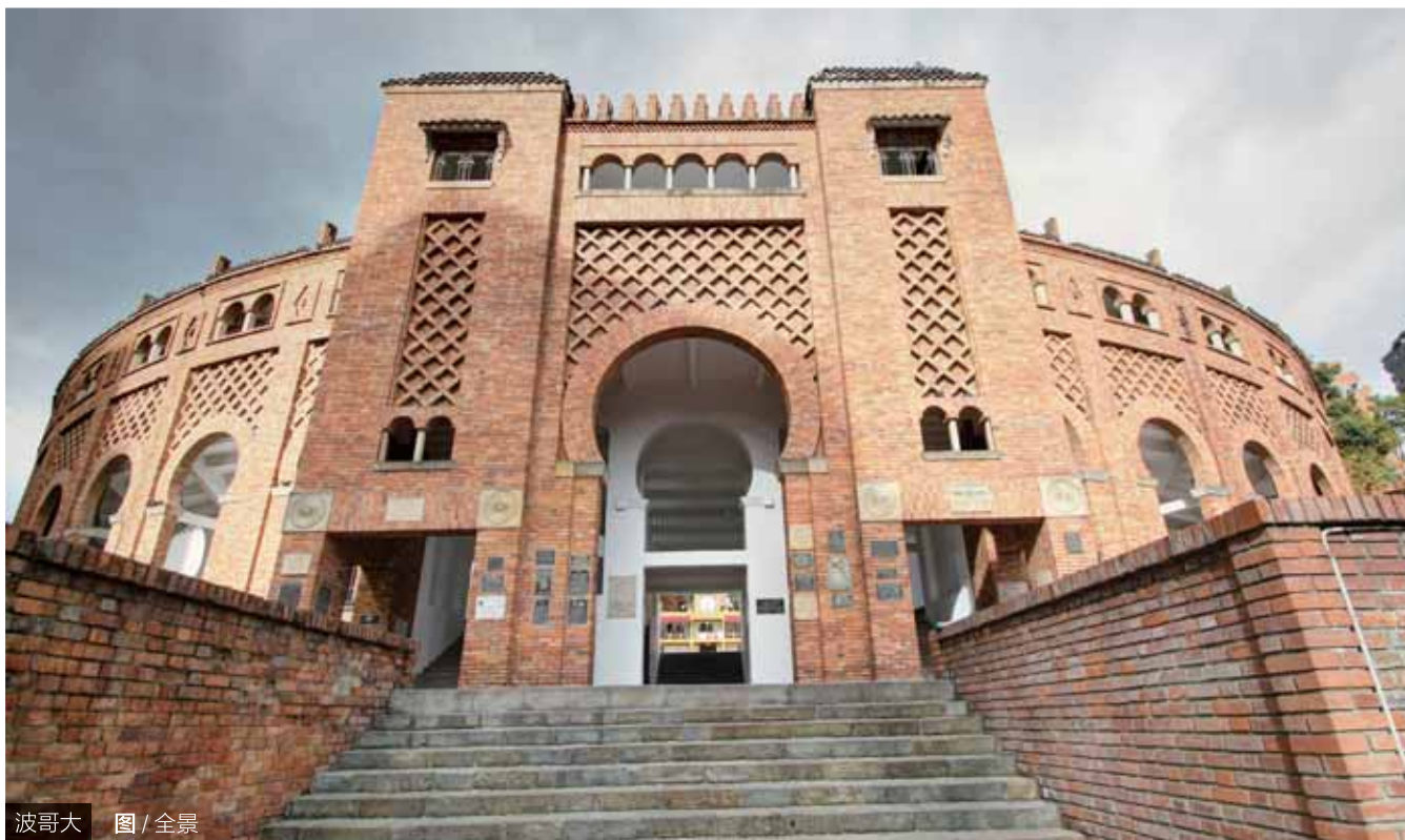
波哥大 图 / 全景

安丽女士表示：“父母带着孩子们入住设施齐全，精心布置的家里，人们可以遵循平常的作息和生活习惯，为孩子准备丰盛的早餐，带他们在后院玩耍，发现除了热门景点之外的当地人才知道的好去处，还可以让孩子近距离地接触当地人。”