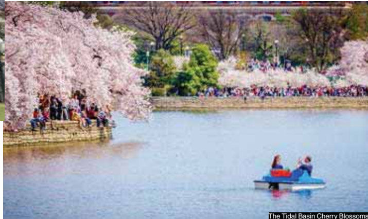
The Tidal Basin Cherry Blossoms

樱花奶昔是汉堡店“好东西小吃”在樱花节期间的主打品牌。将浓浓的香草冰淇淋和甜蜜的樱桃酱混合在一起, 制成的樱花奶昔, 是不可错过的美味。