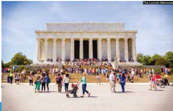
The Lincoln Memorial

The peak season for cherry blossom-oriented tourism in Washington DC, United States is during the months of March and April. The city is also the most beautiful during this time. Cherry blossoms themselves are extremely beautiful; however, their blooming period is relatively short, roughly lasting about two weeks. Cherry blossoms are originally fine and delicate in appearance; however, cherry blossoms that have been transplanted to the US have come to possess a more robust and vigorous spirit due to the nourishment provided by the vast, fertile land. Each and every cherry blossom tree is in full bloom amid the bright sunlight of spring. Each cluster of blossoms, layer upon layer, is absolutely splendid, surrounding the tree in clouds of fragrance and filling the tree boughs with pink. Shedding their weak and delicate image, the cherry blossoms sway gently in the wind, illustrating a flamboyant and dignified beauty.