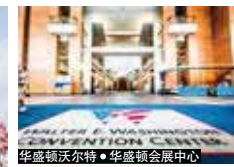
华盛顿沃尔特·华盛顿会展中心