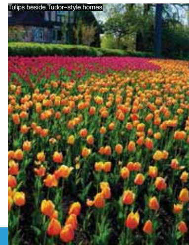
Tulips beside Tudor-style homes

After enjoying the tulips, buying a bottle of maple syrup to bring home is a must. As one of Canada's best known products, maple syrup has a light taste which is quite suitable for children and the elderly. Thanks to its mild taste, it is also suitable for those ill or recovering, especially heart disease and diabetes patients.