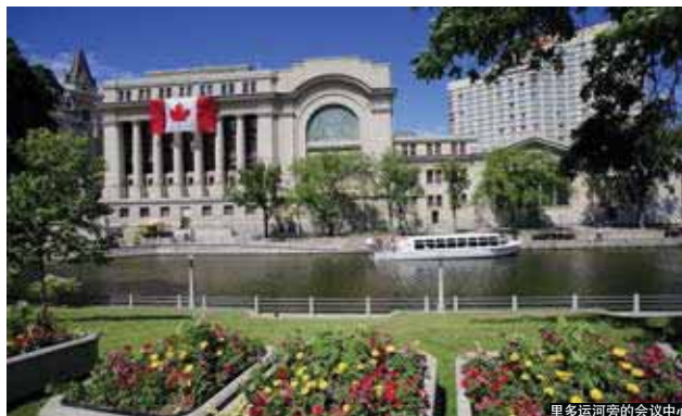
里多运河旁的会议中心