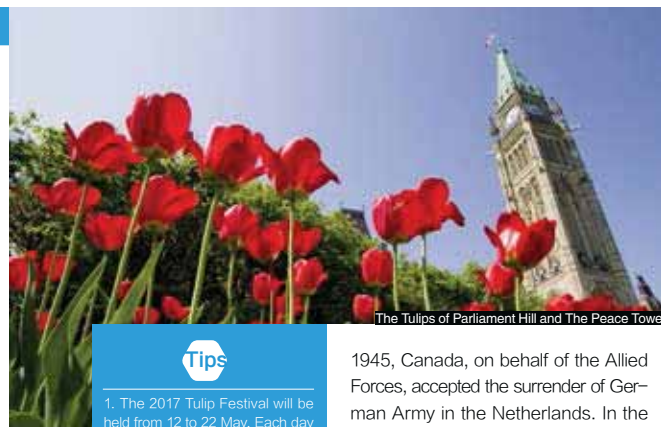
The Tulips of Parliament Hill and The Peace Tower

Late in the winter of 1944, suffering from the devastating cut-off of supplies orchestrated by the Nazi army, the Dutch people had to rely on eating the bulbs of tulips. Despite these efforts, about 20,000 people lost their lives due to hunger and cold. Under these wretched circumstances, many people in the Netherlands saw little hope for their survival. However, when the Dutch people witnessed the Canadian army's advance in the distance, they began to believe in their liberation. After nine months of bloody warfare, on 6 May