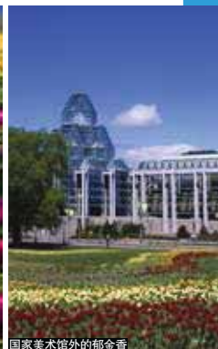
国家美术馆外的郁金香