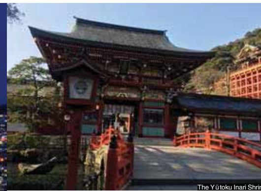
The Yūtoku Inari Shrine