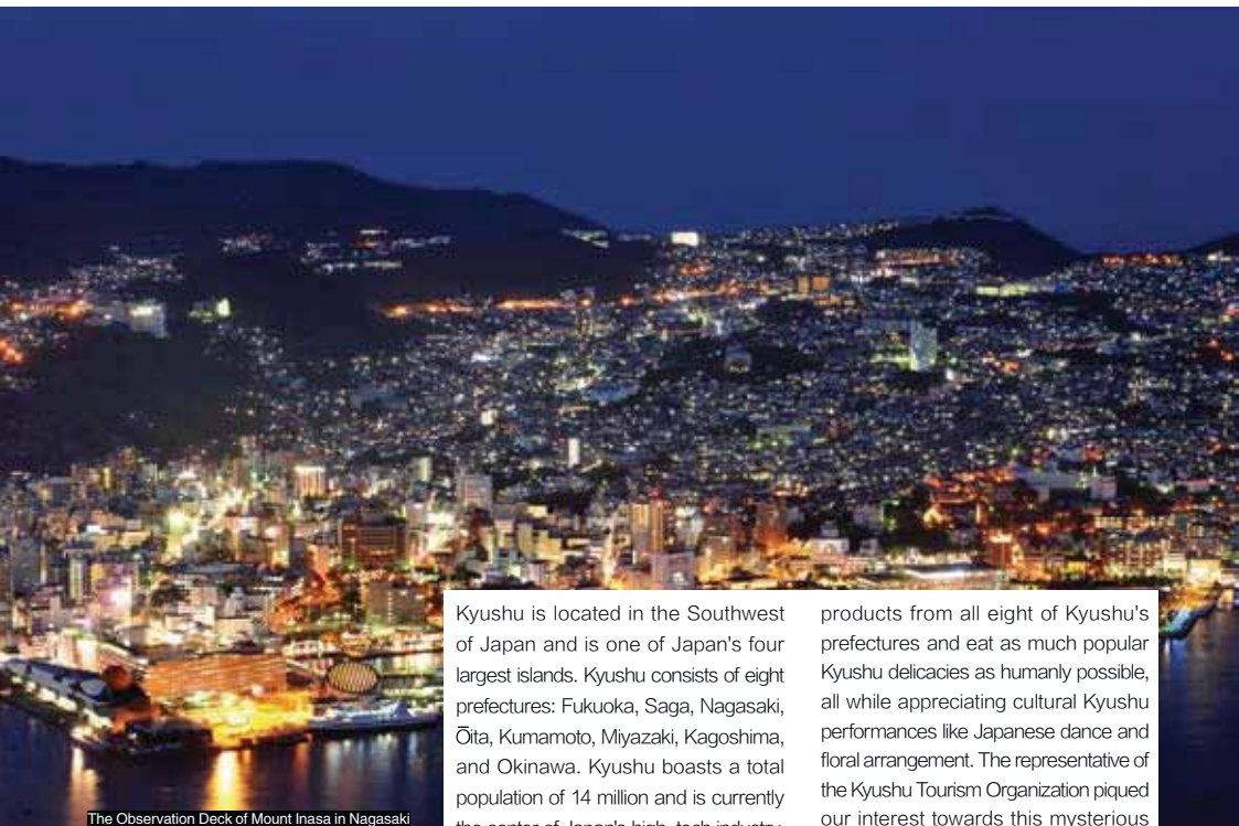
The Observation Deck of Mount Inasa in Nagasaki