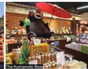
The Kumamoto Bear